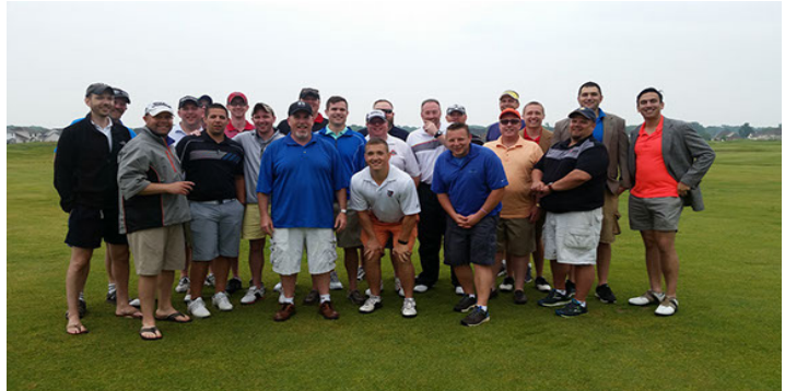
Gamma Zeta Alumni at the Summer Golf Outing in Bowling Green. We hope you can make it next summer! Please watch future issues of the Black Lantern Newsletter for more information.